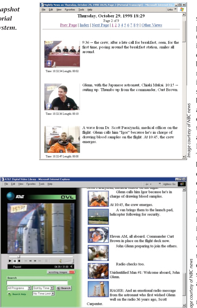
Figure 3. A snapshot from the DVL system at AT&T.

Figure 2. A snapshot from the Pictorial Transcripts system.