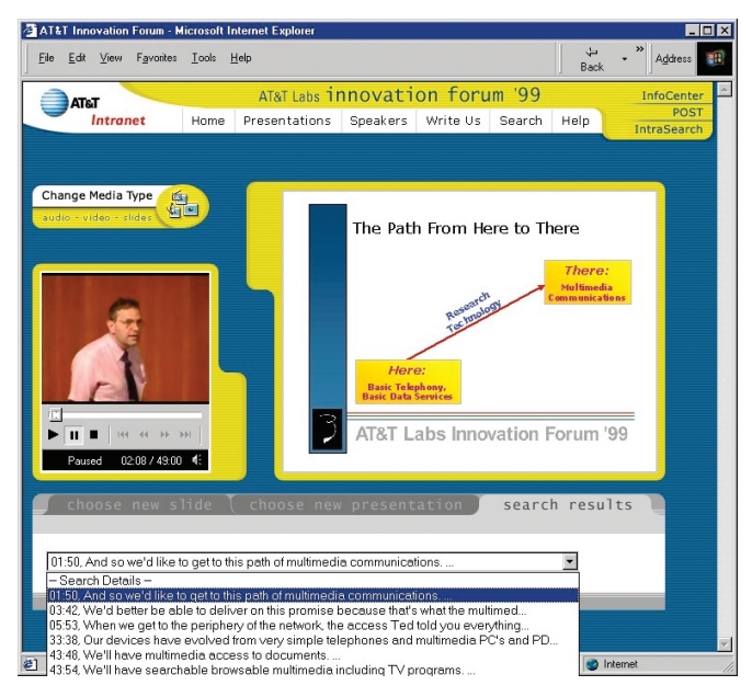
Figure 5. Sample screen of the system for indexing and archiving multimedia presentations.

information by performing optical character recognition (OCR) on the slides, speech recognition, speaker identification and discrimination, and audio event detection. The information extracted by this processing generates powerful indexing capabilities that would enable contentbased retrieval of different segments of a presentation. Users can search an archive of presentations to find information about a topic.