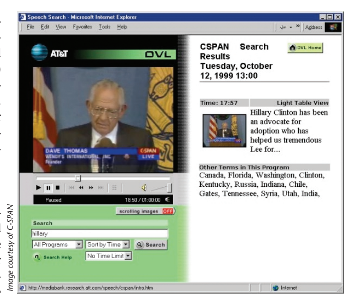
Figure 4. Search based on automatic speech recognition.

Despite the limitations in the robust and effi-